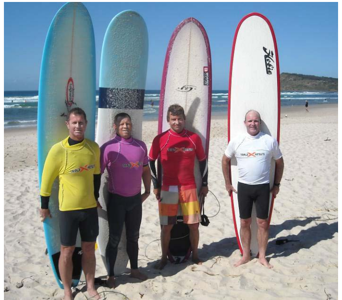
Over 30's Finalists