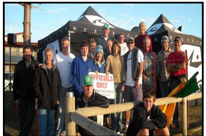
Lennox Members at Gromfest in July