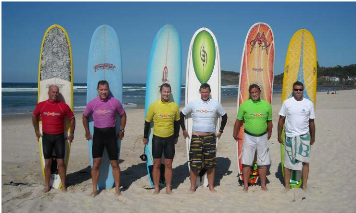
Over 40's Finalists