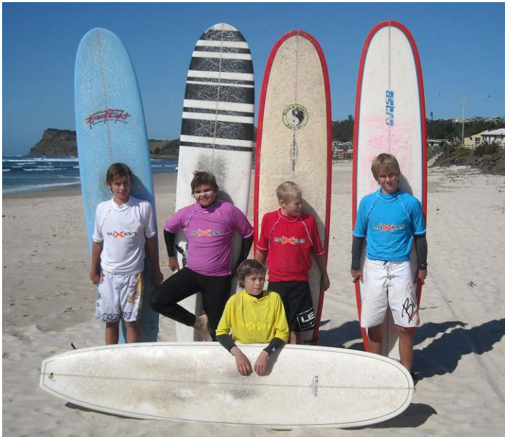
CADET finalists Classic 2010