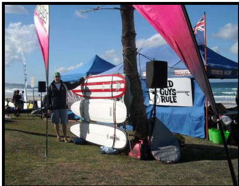
The Longboard Giveaways