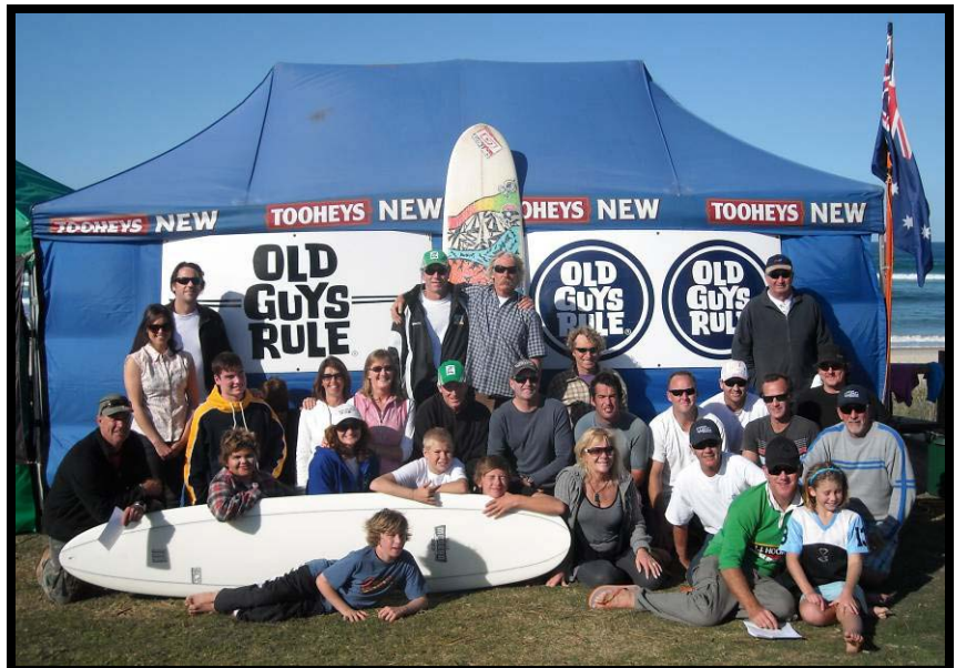
Lennox crew @ The Old Guys Rule 13 th Annual Lennox Longboard Classic 2010

Thank you to all our sponsors both Major & Minor for The OLD GUYS RULE 13 th Annual Lennox Longboard Classic 2010