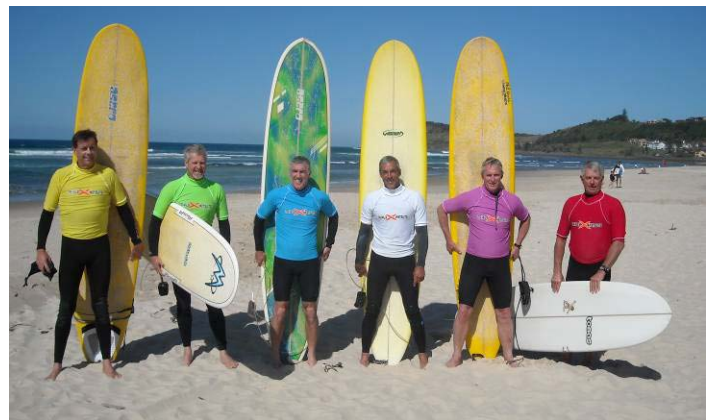
Over 50's Finalists