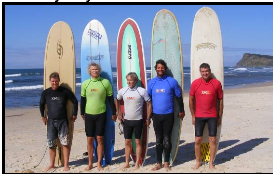
O/40's Finalist's Classic 2009