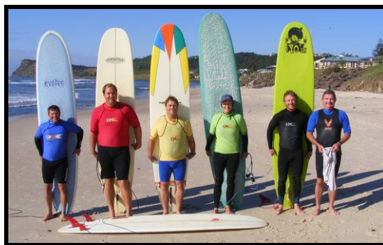
Mystery Finalist's Classic 2009