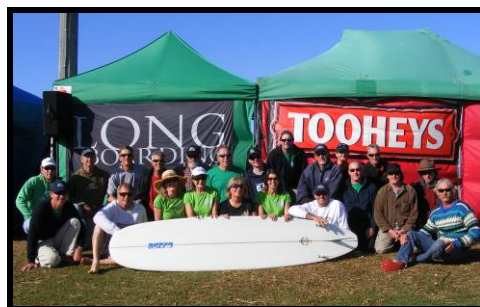
Lennox clubbers Classic 2009