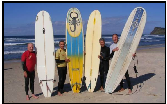
O/60's Classic 2009 Finalist's