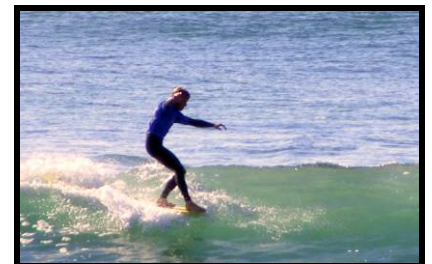
Surfing Sunday Classic 2009