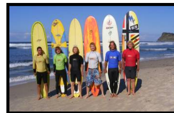
Open 9' Finalist'