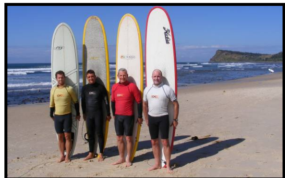
O/30's Classic 2009 Finalist's