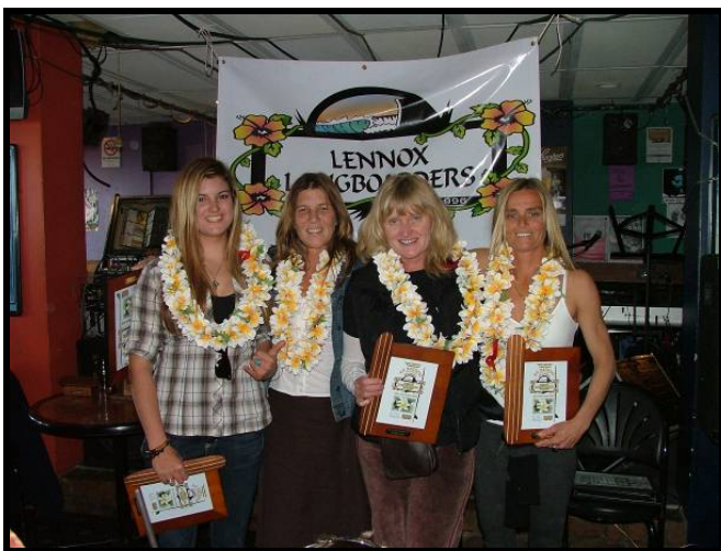
The Ladies Finalists in the UV Natural Sunscreen 11 th Annual Lennox Longboard Classic 2008