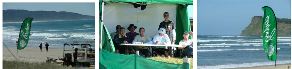
Different perspectives of Classic 2008.