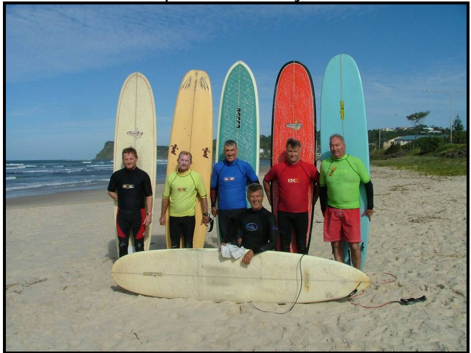
Over 55's Finalists- UV Natural 11 TH Annual Lennox Longboard Classic 2008

Meet @ Lennox Main 7.30am. September – Sunday 7 th