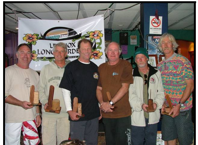
Over 50's Finalists in the UV Natural Sunscreen 11 th Annual Lennox Longboard Classic 2008