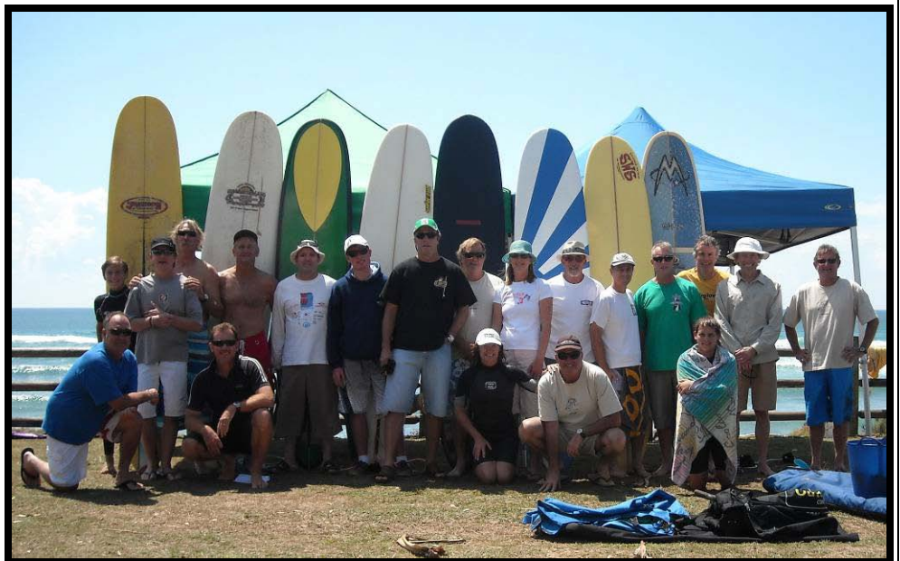
Lennox Longboarders at the Oct 2009 club round

Meet@ Lennox Main 7.30am. Restart 2010 Sunday February 14th