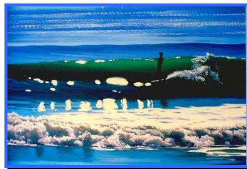
The Arvo Glassoff, rare but a treat