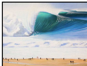
Lennox Main, big day, perfect lefts, dreaming !!!!!