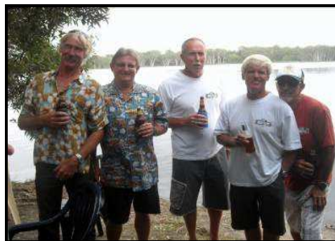
Xmas do @ the lake 2011

ALL ENTRY FORMS CAN BE FOUND ON www.australianlongboarding.com