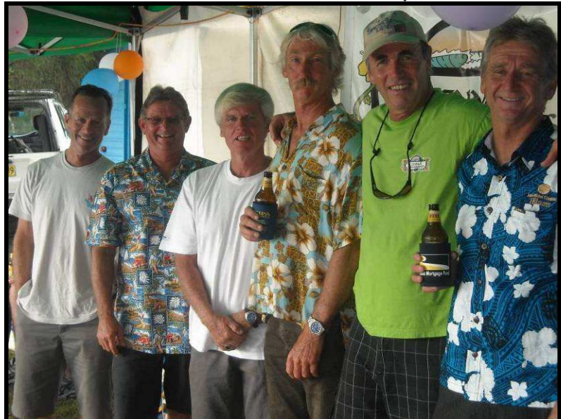
Some of the elected committee for 2012 @ 2011 club Xmas Party...